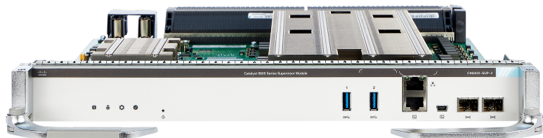
Figure 1. Cisco Catalyst 9600X Series Supervisor Engine 2

The new Catalyst 9600X SUP-2 supervisor is based on Cisco Silicon One Q200 Application-Specific Integrated Circuit (ASIC), which is purpose built for the next generation core with a programmable pipeline (P4) and is the first network silicon to offer switching capacity up to 12.8 Tbps full duplex per ASIC in the enterprise. The Q200 ASIC offers high- performance full routing and switching capabilities without external memories. The Catalyst 9600 Series leverages a high-performance multiple core x86 CPU and is Cisco's leading purpose-built modular core and edge services enterprise switching platform, built for security, IoT, and cloud.