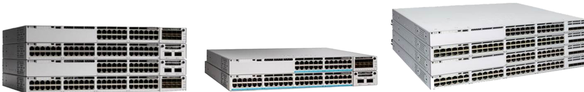
Figure 1. Cisco Catalyst 9300 Series switches

The Cisco Catalyst 9300 Series is made up of nineteen modular uplink switch models and fourteen fixed uplink switch models.