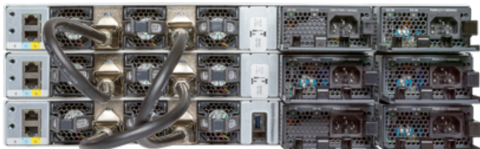
Figure 6. Cisco Catalyst 9300 Series fixed uplink models with optional stack kit