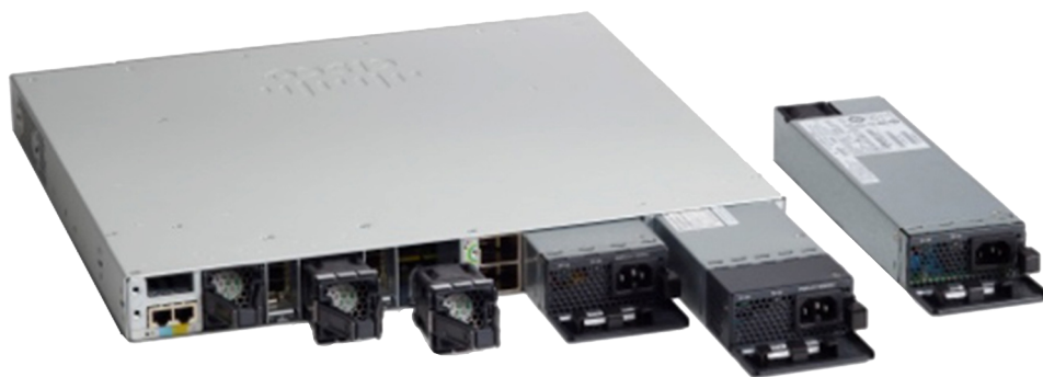
Figure 4. Cisco Catalyst 9300 Series Dual Redundant power supplies

Cisco Catalyst 9300 Series switches support dual redundant power supplies. The switches ship with one power supply by default, and the second power supply can be purchased when the switch is ordered or at a later time. If only one power supply is installed, it should always be in power supply bay #1. The switches also ship with three field-replaceable fans. Power Supplies are common across the Catalyst 9300 Series.