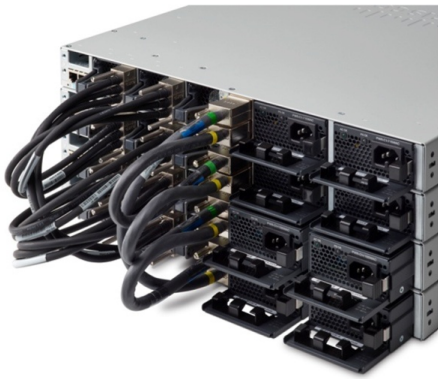
Figure 7. Cisco Catalyst 9300 Series StackPower