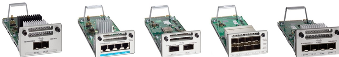
Figure 3. Cisco Catalyst 9300 Series Network Modules