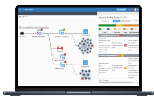
Intuitive view and clear insights into network security posture with FortiManager