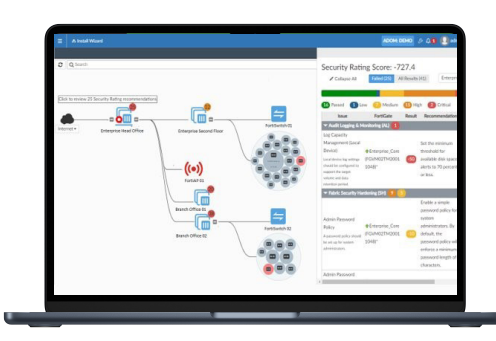
Intuitive view and clear insights into network security posture with FortiManager