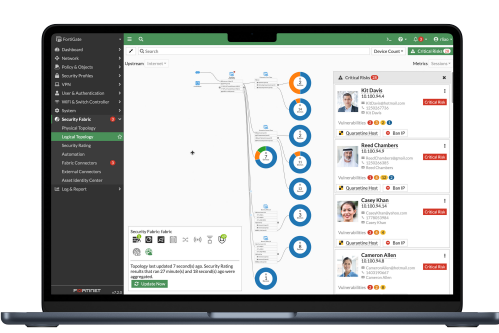
Intuitive easy to use view into the network and endpoint vulnerabilities