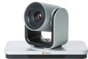
Polycom EagleEye IV 12x Camera (silver)

The Polycom EagleEye Acoustic camera is an optimal solution for a smaller environment. With built-in microphones and small footprint, this camera will easily blend into an executive office or huddle room.