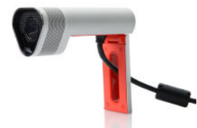
Polycom EagleEye Acoustic Camera