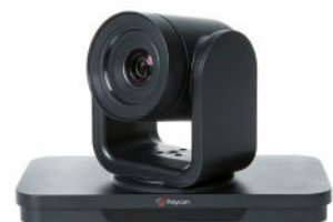
Polycom EagleEye IV 4x Camera (black)