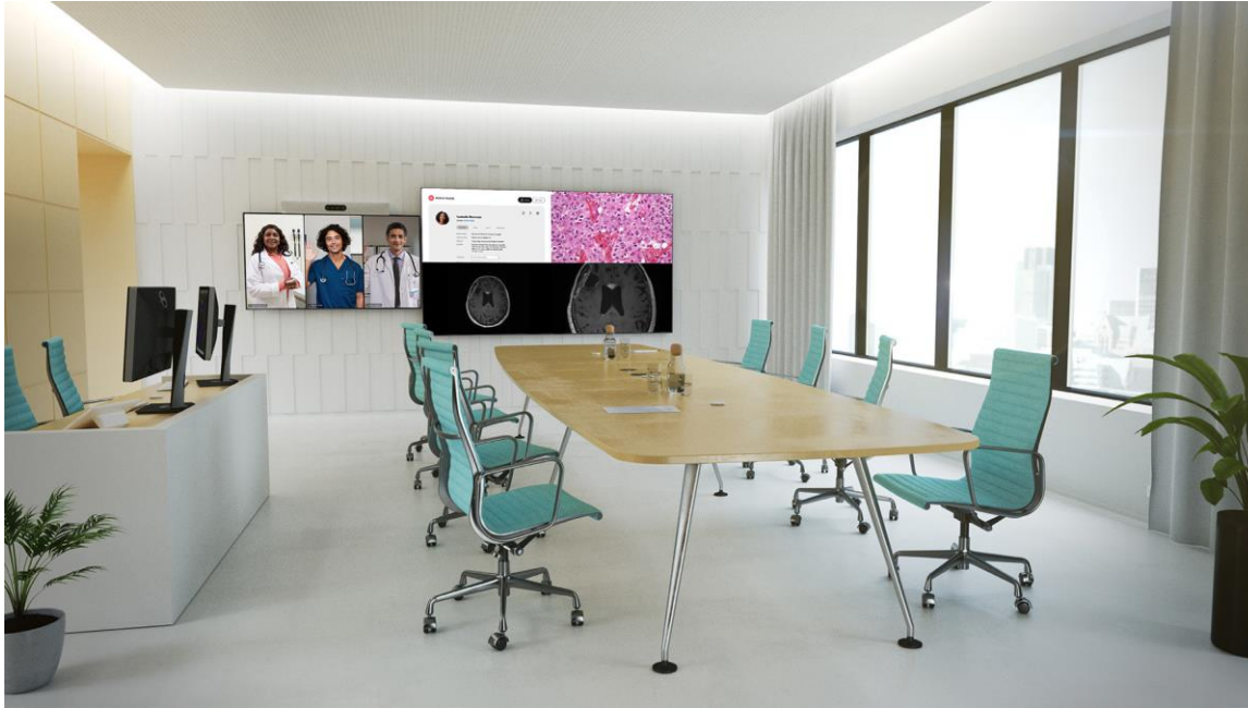
Figure 2. The Room Kit Pro in a large clinical video room powering the Cisco Multi-Content Solution.

With its powerful media engine, the Room Kit Pro lets you build the video collaboration room tailored to your specific requirements.