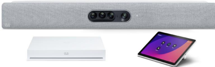
Figure 3. Cisco Room Kit Pro integrator package with Codec Pro, Quad Camera and Cisco Room Navigator.