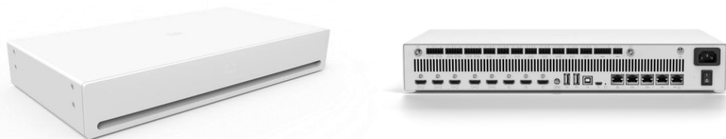
Figure 5. The Cisco Codec Pro.

The Codec Pro is also available separately as a standalone unit.