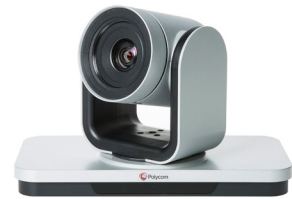
Polycom EagleEye IV 12x Camera (silver)

The Polycom EagleEye Acoustic camera is an optimal solution for a smaller environment. With built-in microphones and small footprint, this camera will easily blend into an executive office or huddle room.