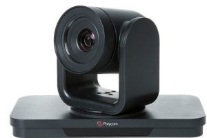
Polycom EagleEye IV 4x Camera (black)