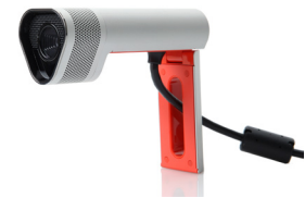
Polycom EagleEye Acoustic Camera