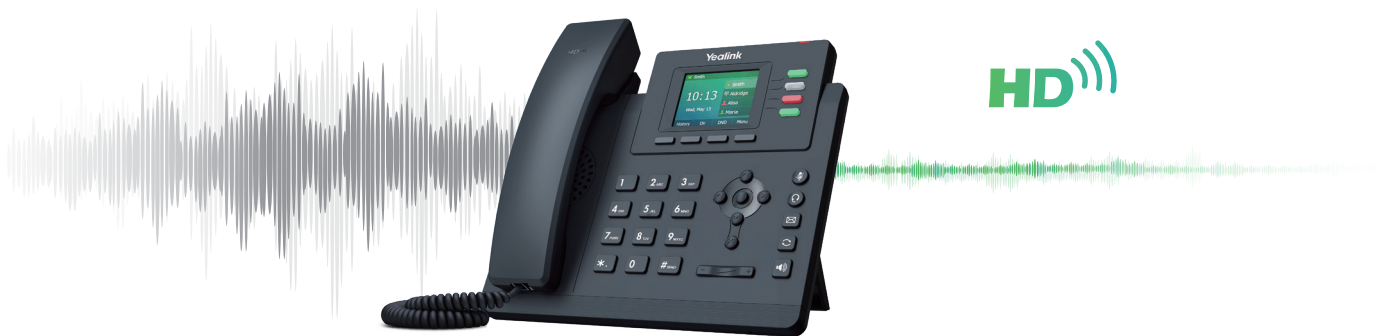
Smart Noise Filtering

The Yealink T3 series provides distraction-free communications with industry leading Smart Noise Filtering Technology, which delivers excellent sound quality without extraneous noises and allows fluent conversations.