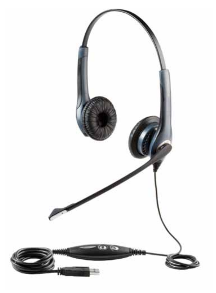
Jabra GN2000 MS USB Duo

To sum it up, this plug-and-play solution combines superior audio performance and durability with all the hands-free advantages of a professional Jabra headset.